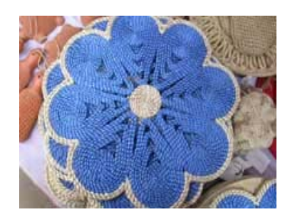
Decorative table mats